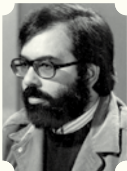
FRANCIS FORD COPPOLA 27