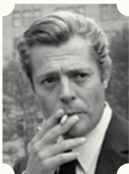
MARCELLO MASTROIANNI 25