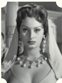
SOPHIA LOREN 25

EVENING COCKTAILS. HERBAL, FRUITFUL BIG VIBRANT FLAVOURS