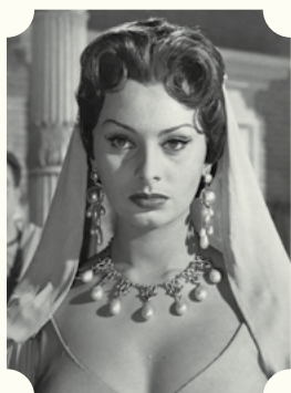
SOPHIA LOREN 25

EVENING COCKTAILS. HERBAL, FRUITFUL BIG VIBRANT FLAVOURS