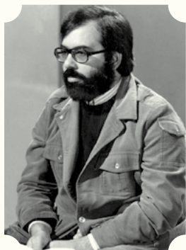
FRANCIS FORD COPPOLA 28