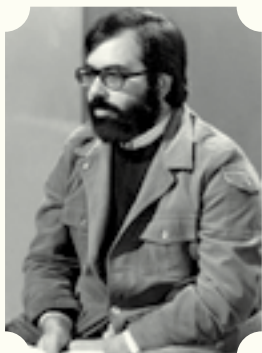
FRANCIS FORD COPPOLA 28