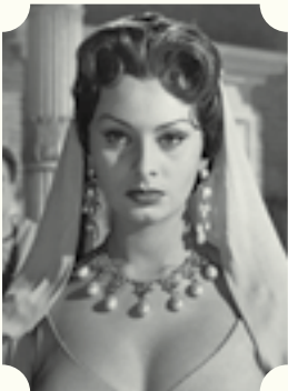
SOPHIA LOREN 25

EVENING COCKTAILS. HERBAL, FRUITFUL BIG VIBRANT FLAVOURS